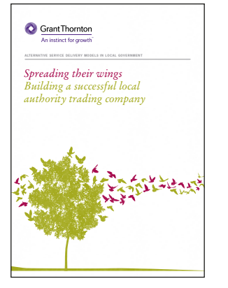
Spreading their wings Building a successful local authority trading company