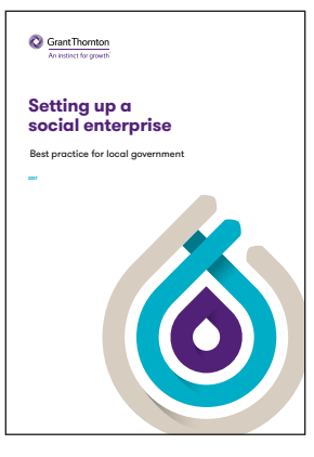
How to set up a social enterprise Best practice for local government