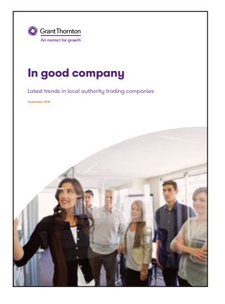
In good company Latest trends in local authority trading companies

Grant Thornton have been researching and publishing reports on alternative delivery models since 2014. Reports in our public sector series are: