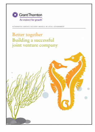
Better together Building a successful joint venture company