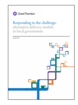
Responding to the challenge Alternative delivery models in local goverment